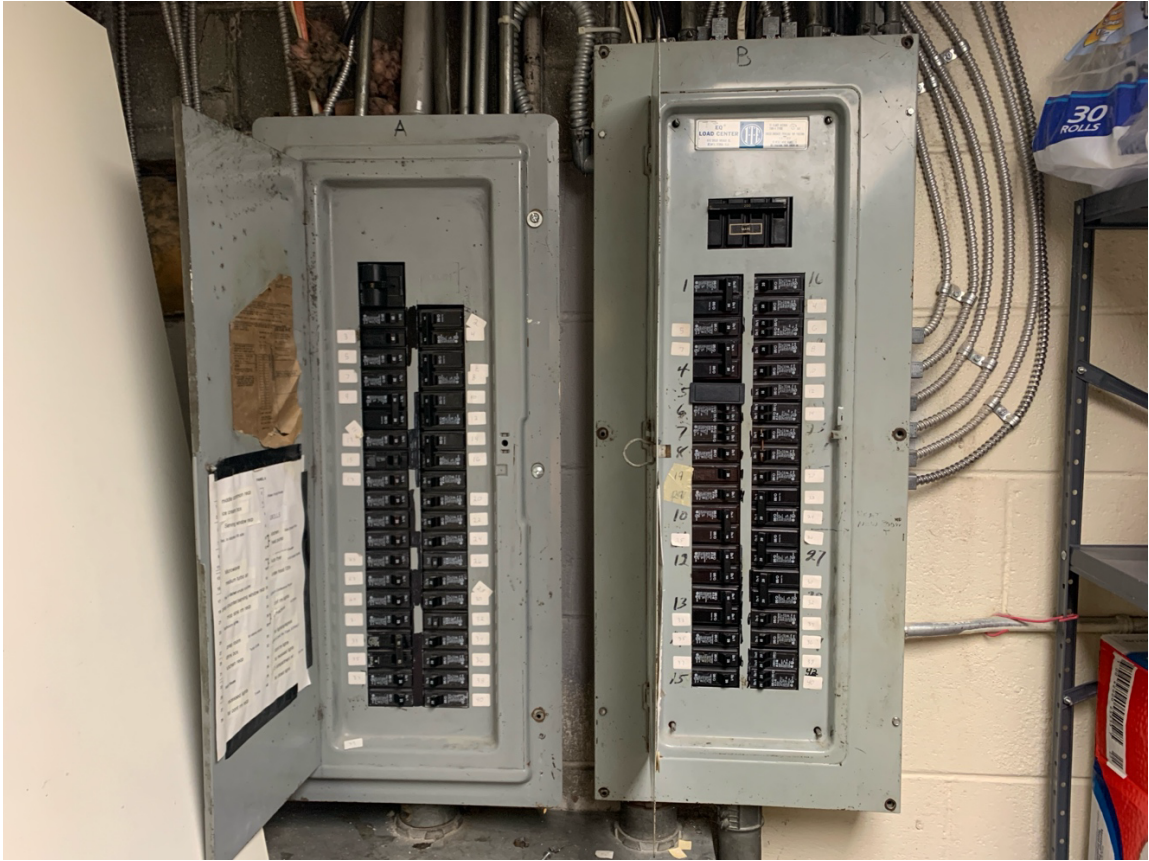
Figure 14 - Clubhouse - Electrical Panels