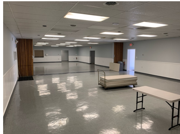
Figure 11 - Clubhouse - Right Side