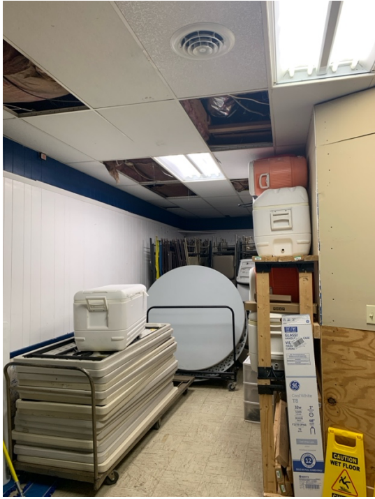
Figure 12 - Clubhouse - Social/Swim Team Closet