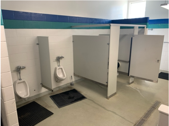
Figure 4 - Men's Restroom - Stalls and Urinal