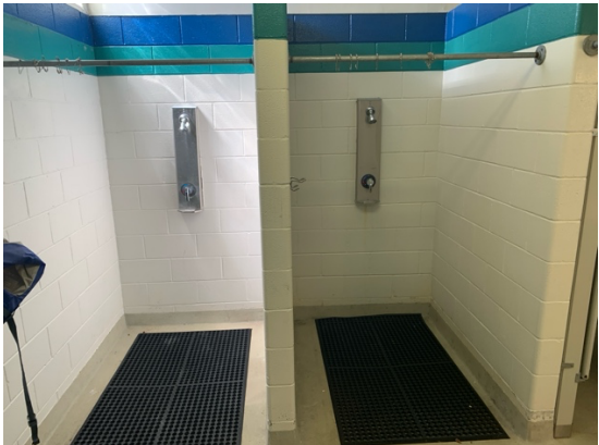
Figure 5 - Women's Restroom - Stalls