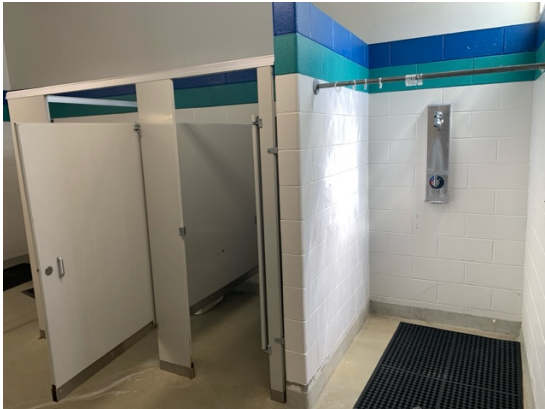
Figure 1 - Men's Restroom - Shower View