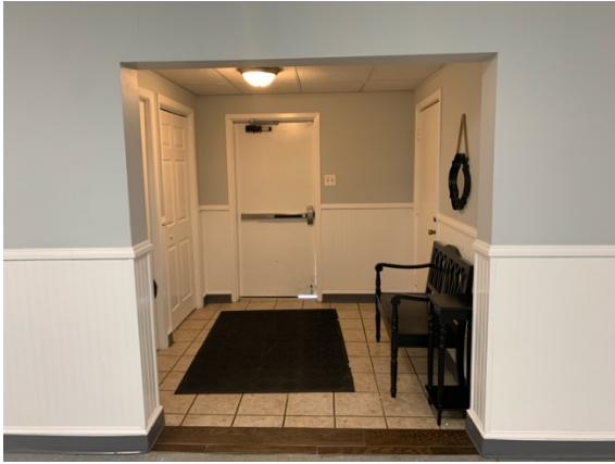
Figure 15 - Clubhouse - Right Entryway