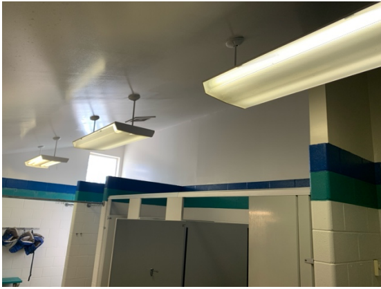
Figure 7 - Women's Restroom – Lighting