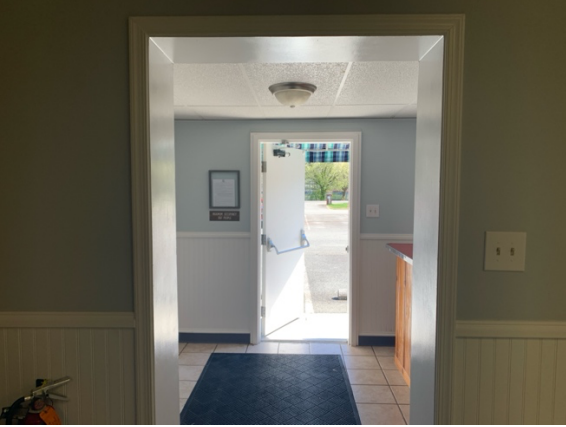
Figure 16 - Clubhouse - Left Entryway