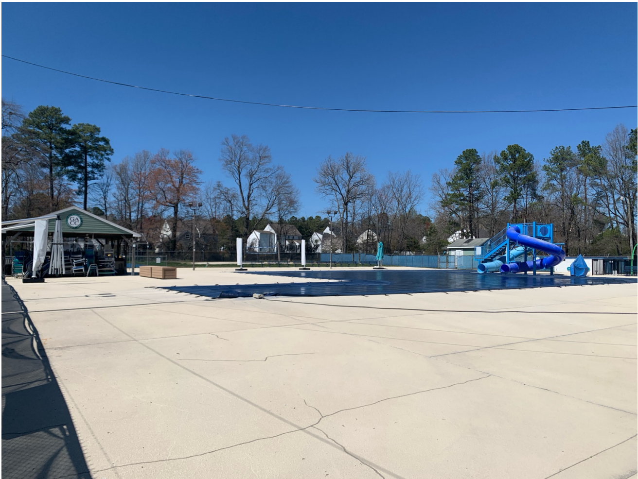
Figure 8 - Pool Deck with Pavilion A

Glen Allen Community Center Physical Address: 10800 Brookley Road, Glen Allen, VA 23060 Mailing Address: Post Office Box 1003, Glen Allen, VA 23060