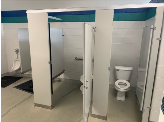
Figure 3 - Men's Restroom - Urinals and Stalls