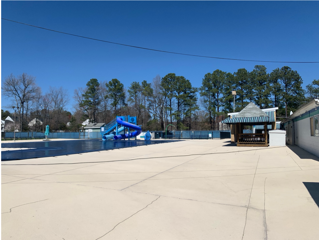
Figure 9 - Pool Deck with Lifeguard Stand, Patio and Snack Bar