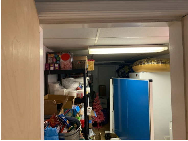
Figure 13 - Clubhouse - IT Closet & Table/Chair Storage