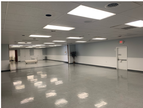
Figure 10 - Clubhouse - Left Side