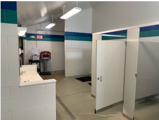
Figure 2 - Men's Restroom - Stall View